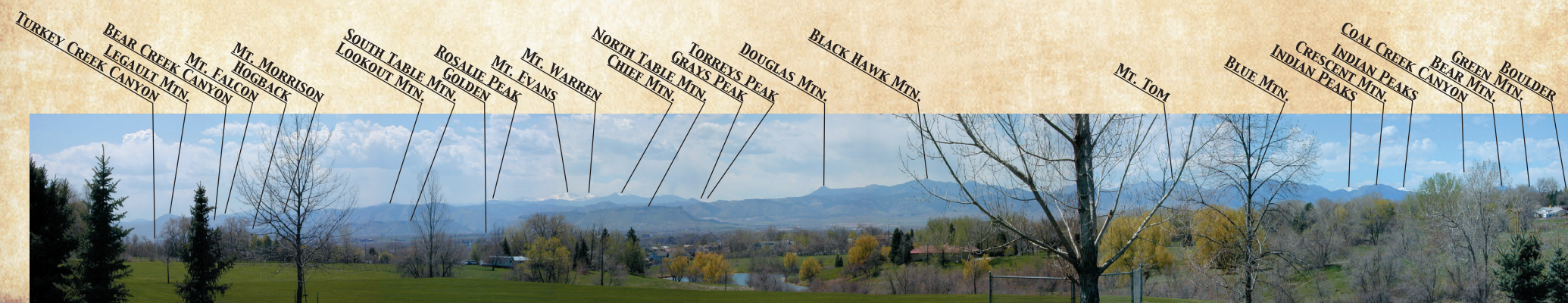
View from the Interpretive Trail looking west.